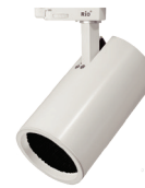
RHC - Honey Comb Filter