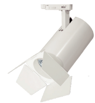
RBD - Barn Door Attachment